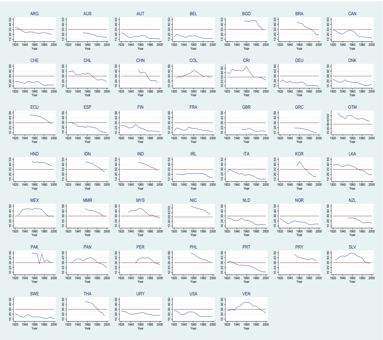
Figure 10: Demographic Transition: Crude Birth Rates

1 2 3 4 5 6 7 8 9 10 11 12 13 14 15 16 17 18 19 20 21 22 23 24 25 26 27 28 29 30 31 32 33 34 35 36 37 38 39 40 41 42 43 44 45 46 47 48 49 50 51 52 53 54 55 56 57 58 59 60 61 62 63 64 65